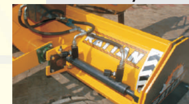
High Quality Hydraulic Jack