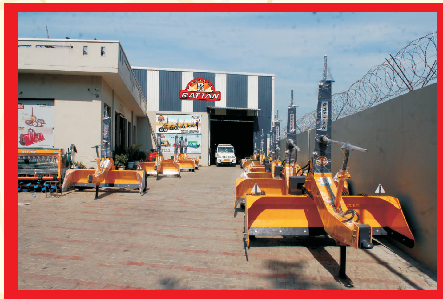
Our New Office Bhadson Road, Nabha

Dedicated Performance & Precious Farming